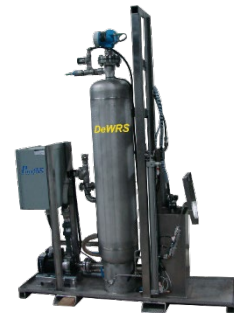
DeWRS (DeWatering Recovery System)