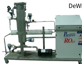
RO (Reverse Osmosis LP)