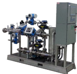
Cuf (Ceramic Ultra Filtration)